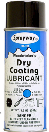
NET WT. 9.5 oz.

ONE PRODUCT THAT PERFORMS THE JOB OF TWO!